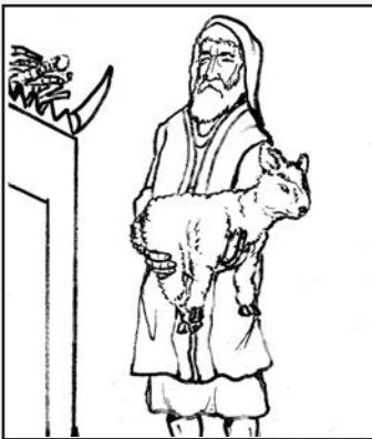
God asks all Israel to love Him.

The Bible is very plain about what God expects from His people. The people show their love to God by their actions. In the same way, God not only says He loves us. But God also shows His love by everything He does. These verses show that we cannot separate our love for God from obedience.