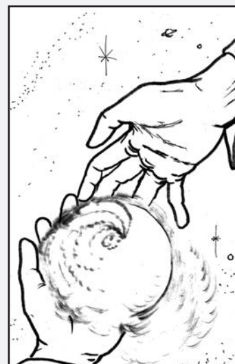
God made a plan to save us before He made the earth.

God showed us on the cross how much He loved us. Why should this Bible truth fill our hearts with joy?