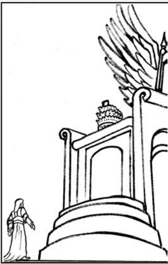
Jesus left His throne because He loved us.